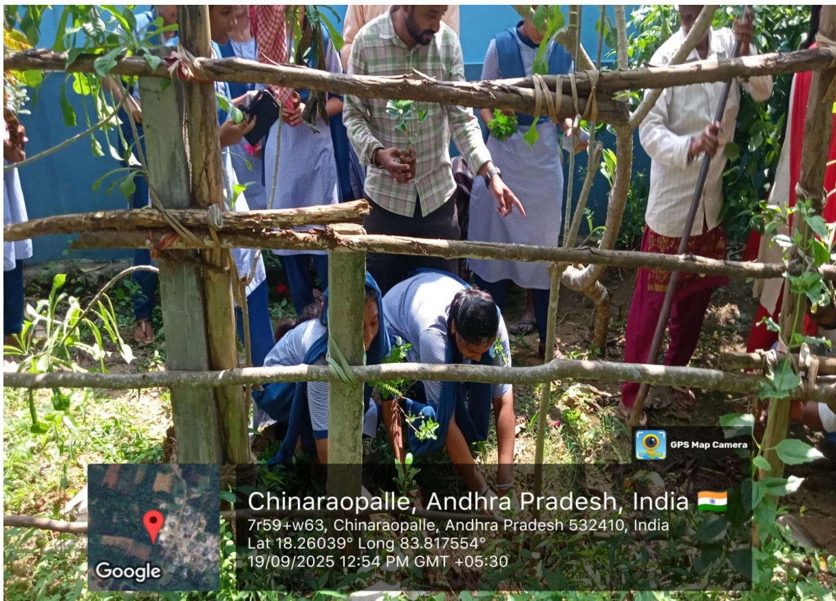
Plantation Programme at Adopted Village Chinaraopalle, Etcherla Mandal, Srikakulam